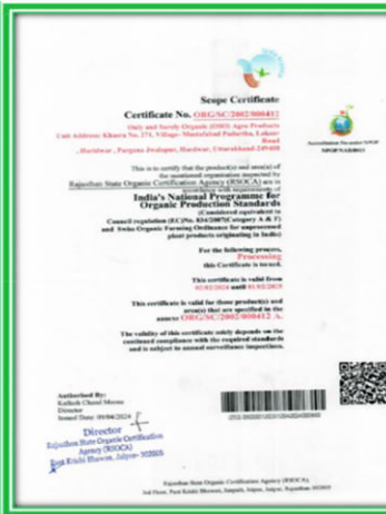
Honey & Jaggery Processing