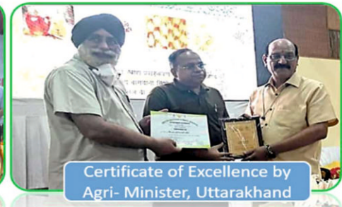
Certificate of Excellence by Agri- Minister, Uttarakhand