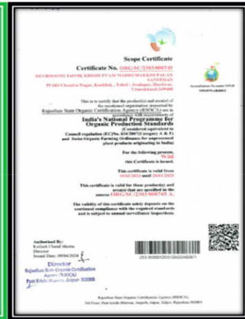
Wild Honey Harvesting