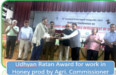
Udhyan Ratna Award for work in Honey prod by Agri. Commissioner