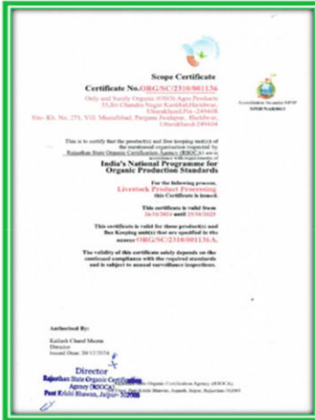
Ghee & Milk Processing