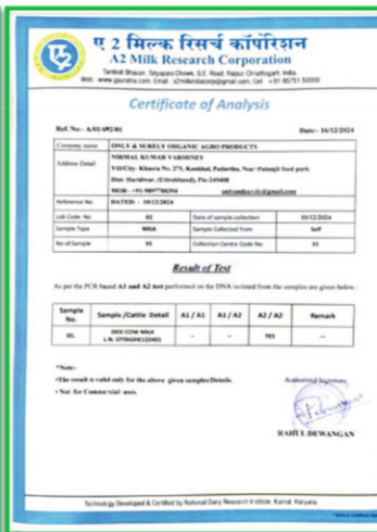
A2 Milk Certification