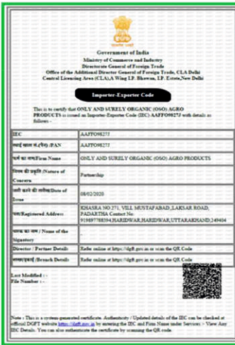
Import Export Certificate