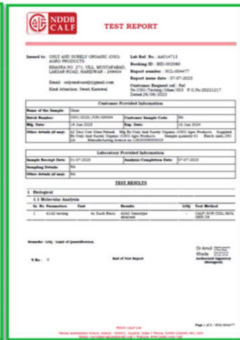
A2 Milk Certification NDBB