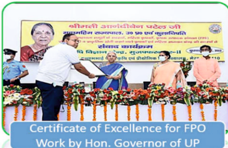
Certificate of Excellence for FPO Work by Hon. Governor of UP